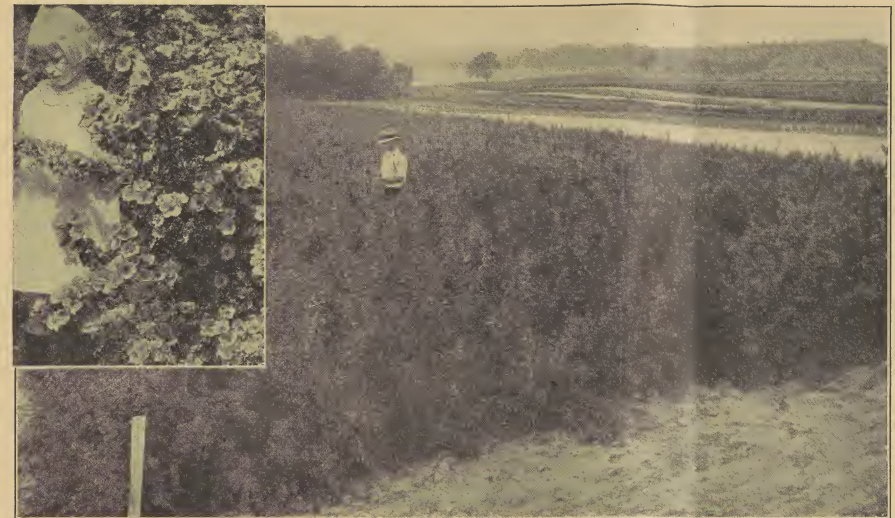
Plenty of choice and every one good— ROSA HUGONIS (Photographed September 22, 1930)

Prices for 100 and 1000, to the trade only 250 of a kind at 1000 rate